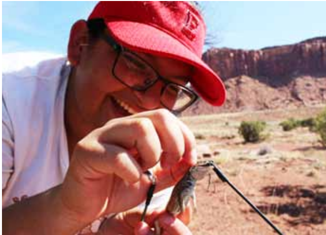
Students studied lizards at the CRC through a program with The Natural History Museum of Utah.