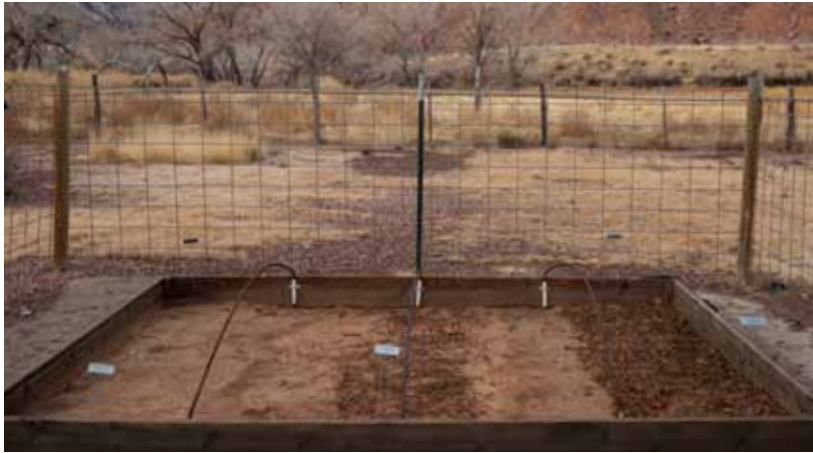
A new garden showcases cutting-edge biocrust reclamation efforts at the CRC.