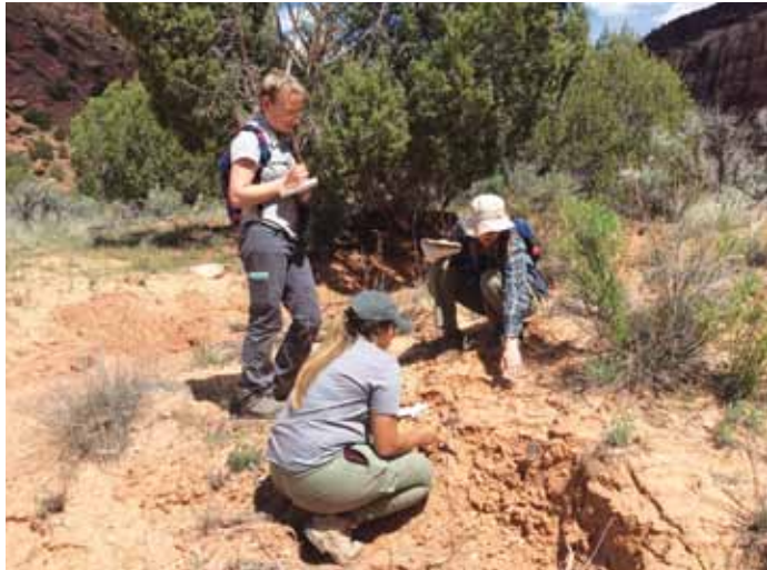
SEEDS program students in the field at the CRC.