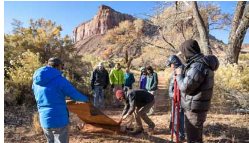
Volunteers help transplant harvested biocrust to its new home on the Colorado Plateau.

This fall CRC volunteers helped complete the final phase of an innovative biocrust reclamation project (learn more on page 5). Volunteers spent the day rolling out biocrust sod over an expanse of 20 acres at sites on the Colorado Plateau. Scientists had salvaged and harvested the sod from the Mojave and Sonoran Deserts, and then nurtured it at a “biocrust farm” owned by Rim to Rim Restoration at the Mayberry Plant Center near Moab. This first-of-its-kind farm played the critical role of “growing” the harvested biocrusts for a couple of years to acclimatize it to local conditions. After the successful inoculation by volunteers, scientists will now monitor the newly planted biocrust to see whether it can thrive in its new home.